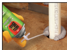
PVC pipe penetration