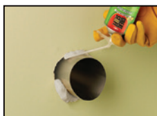
Dryer vent penetration