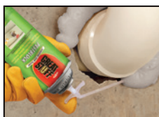
PVC pipe penetration