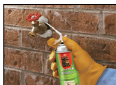
Water faucet penetration