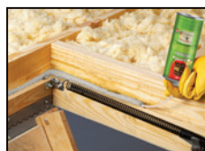
Attic hatch frame