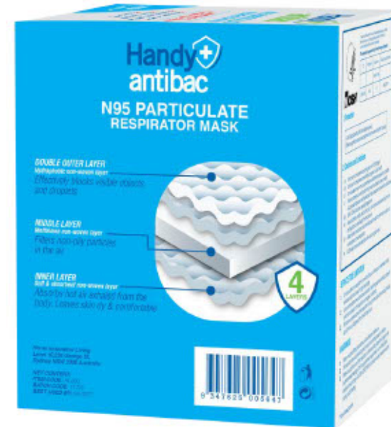
SIDE OF BOX