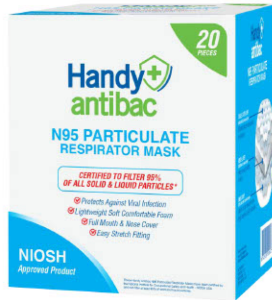
FRONT OF BOX